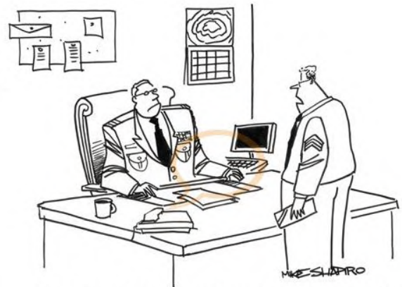
"Well, I would have shown more leadership qualities if someone would have told me to."